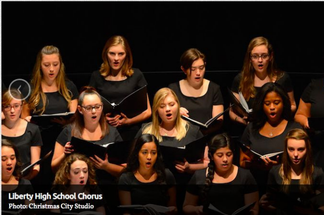
Liberty High School Chorus