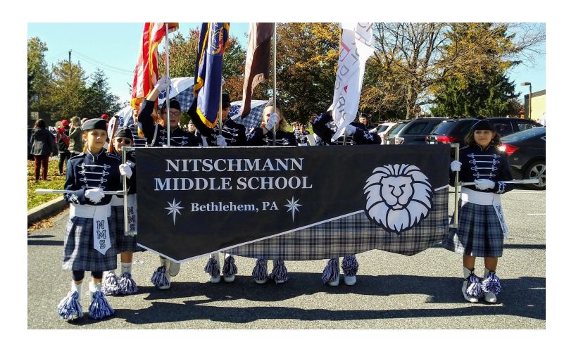
Instrumental Music Recruitment Video