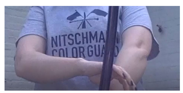
Color guard video

I apologize for the delay. Since this is the first time I created a project of this size, I underestimated the amount of time it would take to put it all together. Thank you to everyone who participated and I hope you enjoy the final product released later today.